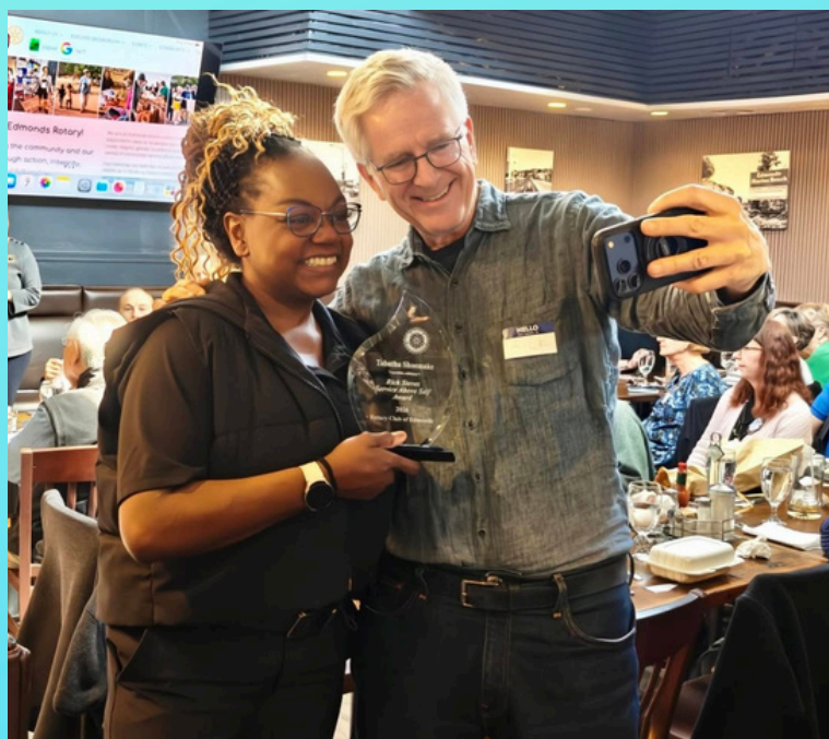
April 7, 2026 The Rick Steves Service Above Self Awards